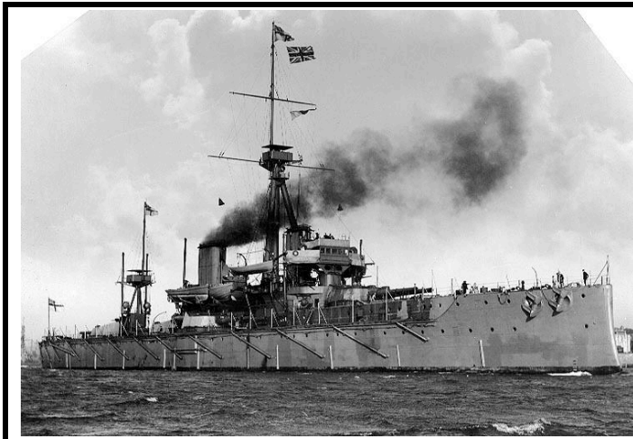
1906 (HMS Dreadnought)

As illustrated in Figure 1, from the mid-19 th century, technologies of wood and sail rapidly gave way to industrial technologies of steel and steam. HMS Victory represents the culmination of agrarian technology: wood and sail ships of the line, which had followed a broadly similar design from the 17 th century until 1850. HMS Warrior characterizes the first stage of the breakthrough to iron construction and steam power. HMS Devastation marks the completion of the turn to iron and steam construction. HMS Dreadnought demonstrates the breakthrough to the fully modern battleship.