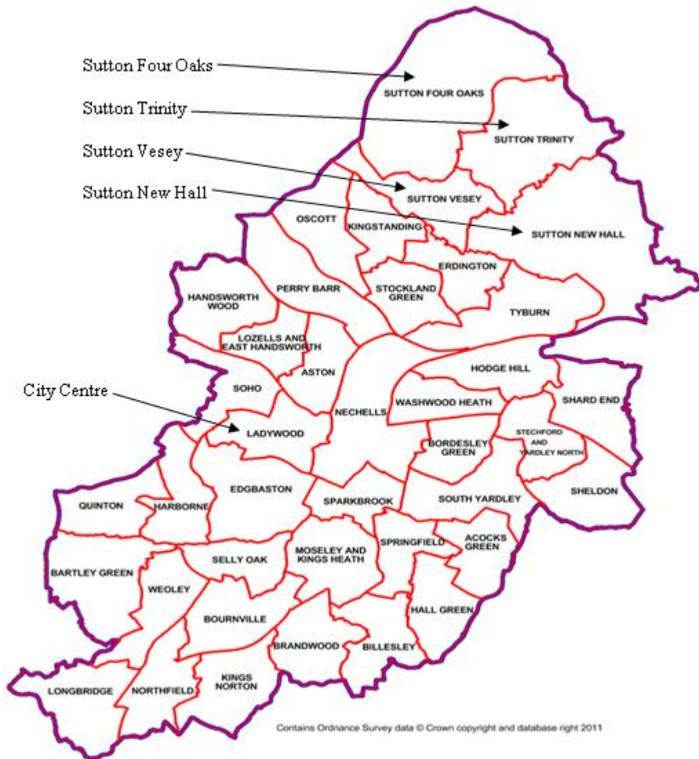
Figure 2. Ward map of Birmingham

While considering the wards and super output areas that contain residents who most strongly demonstrate characteristics of potential alternative fuel vehicle drivers, it is also of interest to consider the wards which have a population least likely to be early adopters of alternative fuel vehicles. The ‘unlikely adopters’ cluster, constituting 298 super output areas, had the lowest mean values. The highest concentrations of super output areas in this cluster (37%) are located in the wards enveloping the city centre, Aston (12%), Ladywood (11%) and Nechells (14%). These wards have the lowest car ownership levels and are amongst the wards with the highest levels of unemployment and Local Authority housing. In contrast to the ‘early adopter’ cluster, only 17% of the population in the wards identified here are home owners. Thirteen per cent of the population live in detached or semi-detached houses, just under one third of the population travel to work by car, 6% own two or more cars and 11% are professionals or managers.