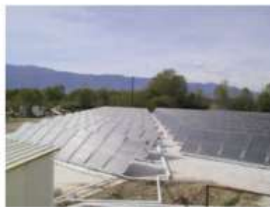
Fig. 3. 706 kW solar thermal plant in dairy industry in Greece [94].

Table 7 illustrates the main industrial application areas where a solar pasteurization or a solar sterilization system is already in use, their key features, solar collector information and also operational temperature data.