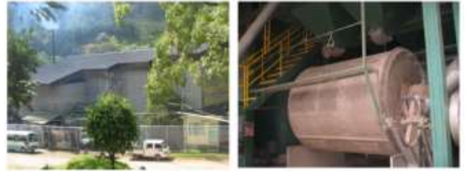
Fig.2. Copendos, Costa Rica coffee drying process [79].