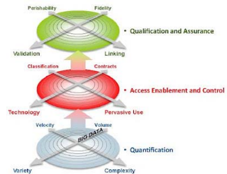
Fig. 2. Extreme information concept [20]

These are considered the main dimensions of big data. In addition to the 3Vs, many authors and companies have been adding features over the time. IBM added veracity as a fourth dimension [8], which refers to trustworthiness of the data. As the number of resources grows, unreliability and inaccuracy inherent in some sources of data increase as well. Variability and complexity were introduced by SAS as two additional dimensions. While variability refers to the variation in data flow, complexity refers to the fact big data are generated through innumerable sources [19]. From earlier studies to the more recent research, the definition of Big Data has advanced. Research sorts out up to twelve dimensions in three tiers with four dimension each. On the first tier, there are the three main big data characteristics of Volume, Velocity and Variety, and Complexity.