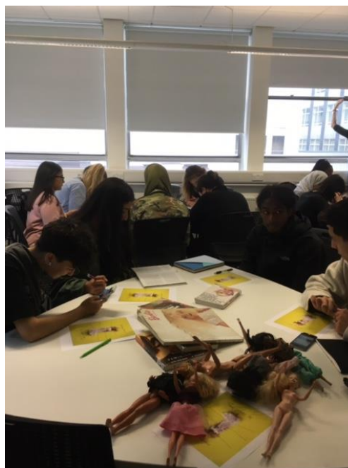
Figure 6: Students in 'Unpack Barbie' session