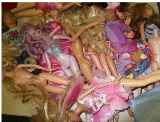
Figure 5: Examples of objects in 'Unpack Barbie' session

opportunity and a safe learning environment in which students can develop the critical thinking, questioning and visual literacy skills which are the intended outcomes of the session. This example of object-based learning in practice is a good example of 'reflection in practice,' as identified by Schön (1983) where students reflect, evaluate and take action through making decisions during the object handling activity. 'Unpacking Barbie' has been successful for the LCF Library and Academic Support teams and is now in its third year. Feedback suggests that, as a result of taking part in the workshop, students feel that they have acquired new research skills and talk fondly of the experience and how they have used the library and will continue to do so throughout their studies.