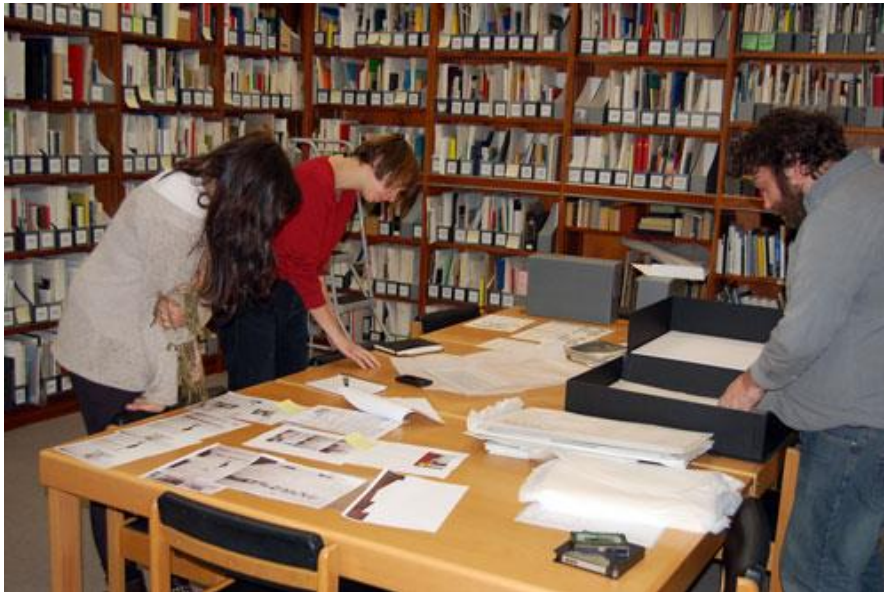
Figure 7: Chelsea College of Arts students and staff participating in special collections session