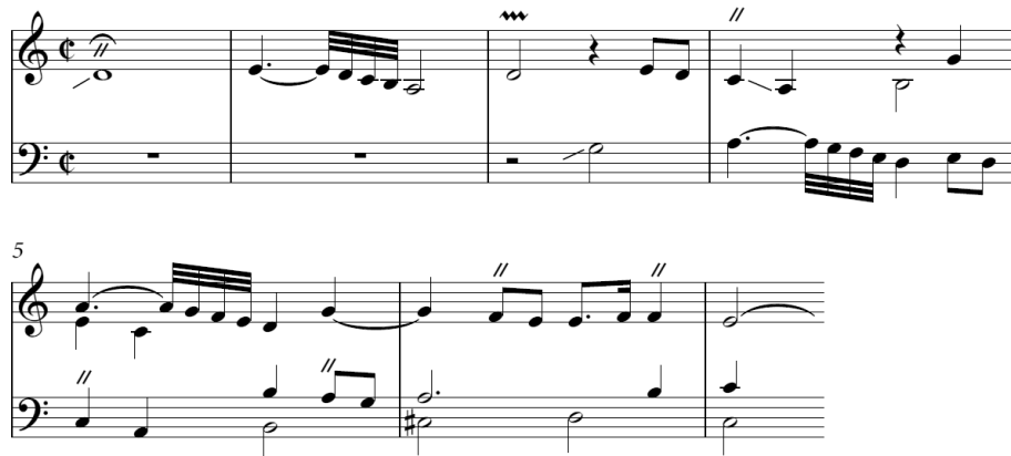
Ex. 5a: FbWV 204 (source Blow ), bars 1–7.

(Innsbruck, private collection, written after 1702). Example 5(a) gives the opening of FbWV 204 in the highly embellished version written by John Blow in England between 1698 and 1708. 49 In France, while Roberday printed his variant of the popular first ricercar from Libro Quarto (1656), FbWV 407a, in open score and unornamented, later French publications, for example, the organ music included in d’Anglebert’s Pieces de Clavecin of 1689, embellish on a large scale, with a density of ornaments approaching one symbol on every minim beat, see Example 5(b). 50