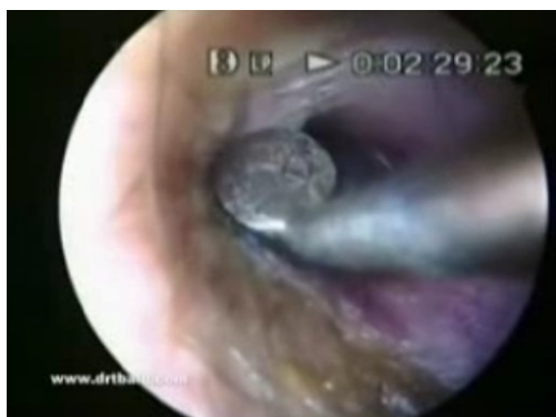
Elevation of tympanomeatal flap (Endoscopic view)

Elevation of tympanomeatal flap was fairly simple. Image resolution was excellent. With minimal manipulation of endoscope the entire area of tympanic membrane could be clearly seen.