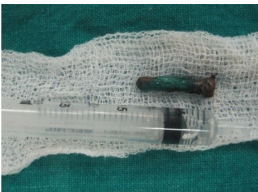
FB after removal Fig 6