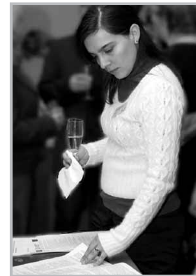
CCS PhD student at an event

Botswana, Brazil, France, Great Britain, Hungary, India, Italy, Jordan, Macau, Norway, Pakistan, Spain, Sri Lanka, the US and Venezuela.