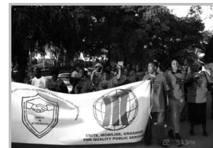
Mothei Trade Union-Moremi.

The programme will provide a well-funded platform for the development of theory on non-governmental public action, for engagement with policy-makers and practitioners and for innovative work that spans the gap in research on the links between 'the