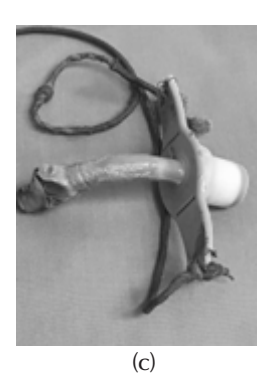
Figure 1: The figure shows a) the patient's tracheostomy tube protruded anteriorly from stoma due to presence of hypertrophic scar (arrow); b) close up view of the hypertrophic skin after the tracheostomy tube was changed to a microlaryngeal tube size 6 (white arrow); and c) patient's cuff tracheostomy tube that was dirty and mouldy