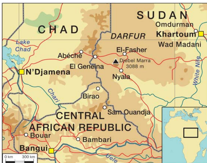
Figure 2: The tri-border region of eastern Chad, north-eastern CAR and Darfur

When examining the triangle of intersecting national boundaries in north-central Africa, it is helpful to visualise a braid. Chad, CAR and Sudan each represent a ‘thread’ that is defined not only by its borders, but more so by multiple ethnic groups, languages, traditions and beliefs. Such elements are further woven into a vast and diverse topography that ranges from dense forest and savannah in the south to long stretches of arid deserts in the north. An examination of a map of this region (see Figure 2) reveals deceptively clear state boundaries that are challenged by the reality of porous borders, which allow goods and people to travel between states, contributing to the patchwork nature of this region. Such fluidity has much significance as problems and events often reverberate across state boundaries.