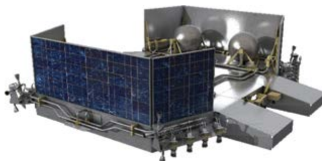
Figure 2: Lunar pallet lander only.