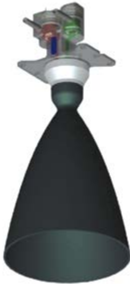
Figure 3: ISE100 fabricated in 2014.

The inspace engine (ISE100) is a 100-lbf thruster that operates using MMH and MON25 (fig.3). The SMD has funded this technology development for use on interplanetary missions (including landers) to reduce the heater requirements for propellants and to allow a high thrust to weight engine that requires low volume for packaging. The engine can operate with propellant temperatures as low as -40^{\circ}\text{F} .