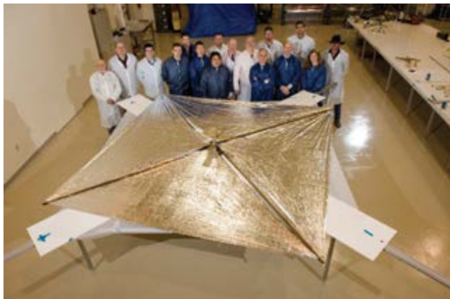
Figure 3: The fully deployed 10-m 2 NanoSail-D solar sail.

The solar sail propulsion system, the primary technology innovation to be flown on the spacecraft, is based on the successful NanoSail-D solar sail developed and flown by MSFC in 2010 (fig. 3). The sail system consists of four 7.3-m stainless steel booms wrapped on two spools (two overlapping booms per spool). The booms will pull the sail from its stowed volume as they deploy. The sail material will be 3 \mu\text{m} CP1, an aluminized polyimide.