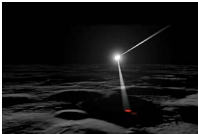
Figure 1: Artist concept of the Lunar Flashlight mission over the lunar surface.