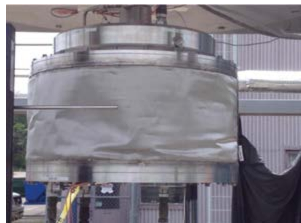
Low-profile diffuser being tested with wire-cloth attached using hot-wire anemometer to measure external velocity profiles.