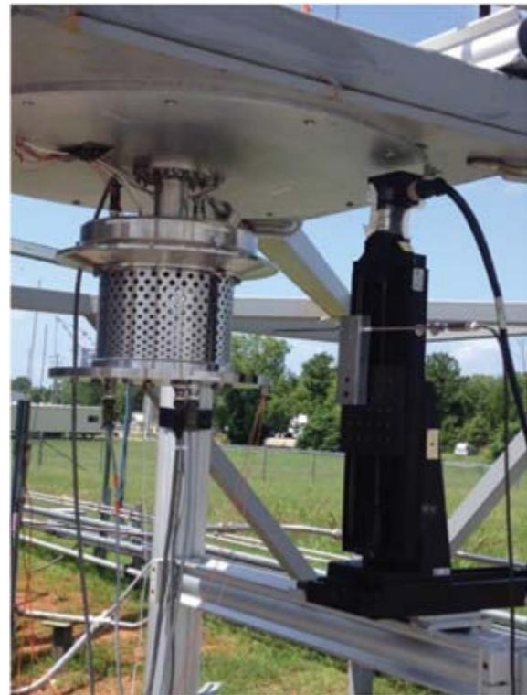
Low-profile diffuser being tested without wire-cloth attached in order to validate CFD model.

The purpose of the task was to create a diffuser design that had a lower vertical profile (in order to be able to raise the liquid surface) while still maintaining uniform flow.