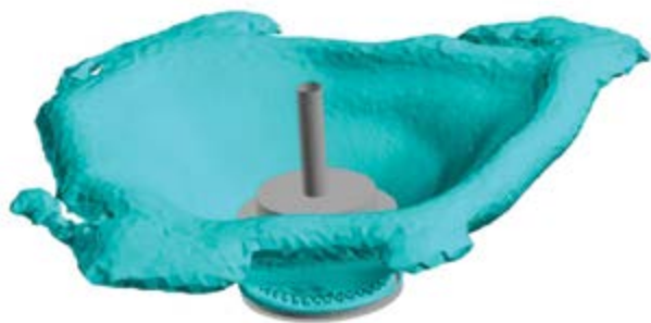
GN 2 Test Conditions—No Screen