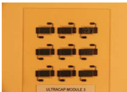
Ultracapacitor single cells printed using 3D aerosol jet printing—the first board printed using multiple single cells to test scalability.