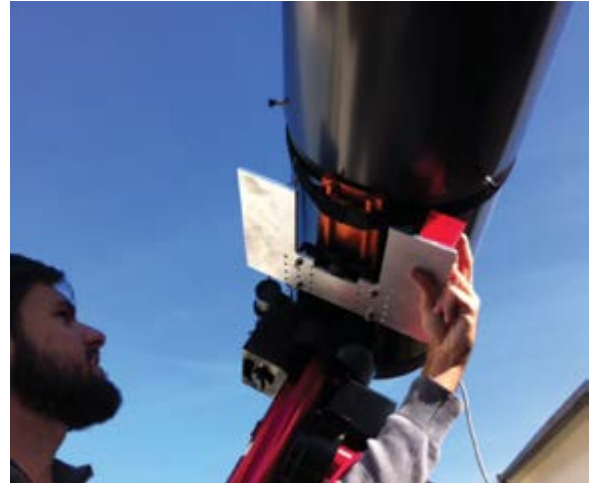
Figure 2: Star tracker mount on ALAMO telescope.

The project kickoff was completed in August 2014 and performance requirements have been defined. Prototype design is underway including electronics, optics, and software. A bracket has been designed and fabricated for mounting the prototype on the ALAMO telescope (fig. 2).