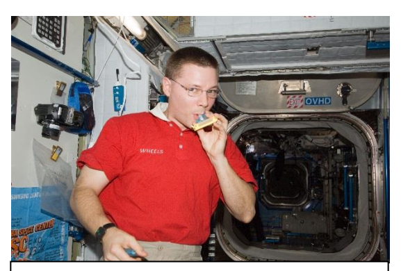
Figure 5. Astronaut Doug Wheelock collecting saliva sample during spaceflight operations.

In addition, Pierson and Mehta (5, 6) have studied latent herpes viruses in astronauts for nearly 20 years in spacecraft (Space Shuttle, Soyuz, Mir, and ISS). They found that EBV, VZV, and CMV reactivate and are shed in saliva (EBV, VZV) or urine (CMV) at levels that far exceed control subjects (9, 10). Figure 5 shows an image of saliva being collected during spaceflight saliva collection. The viruses remain latent until the immune system, specifically Tcell function, decreases to levels that can no longer control reactivation of the latent viruses.