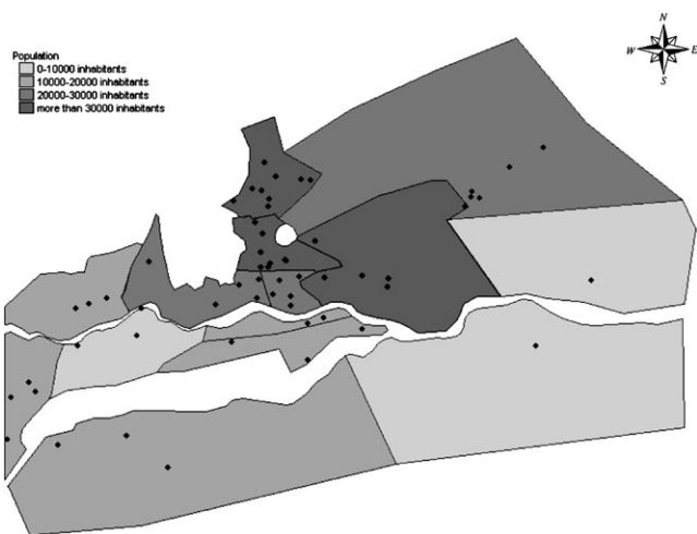
Figure 2. Distribution of the randomly selected starting points (black dots) in the different sanitary areas.

■ January 2009 mass vaccination campaign: excluding persons vaccinated through the routine system, an individual with vaccination registered on a vaccination card or for whom the interviewed person reported that the child had received a dose of measles vaccine between 29 January 2009 and 5 February 2009.