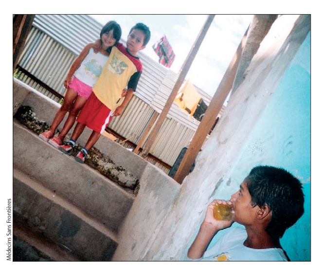
Figure: Street children in Tegucigalpa, Honduras

10–100 million street children and young people worldwide, mostly in developing countries.<sup>2</sup>