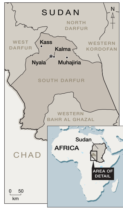
Figure 1. Location of Kass, Kalma, and Muhajiria in South Darfur, Sudan

ties (Humanitarian Aid Commission) and were described to IDP community leaders who agreed to and in many cases facilitated the survey. No incentives were offered to participants or officials. The interviewee was the most senior adult household member, who gave oral informed consent to participate in the study. For children aged 6 to 59 months, consent to anthropometric measurement was obtained from a parent or guardian. No names were obtained or recorded except when respondents agreed to the referral of malnourished children or sick individuals to the relevant MSF clinics.