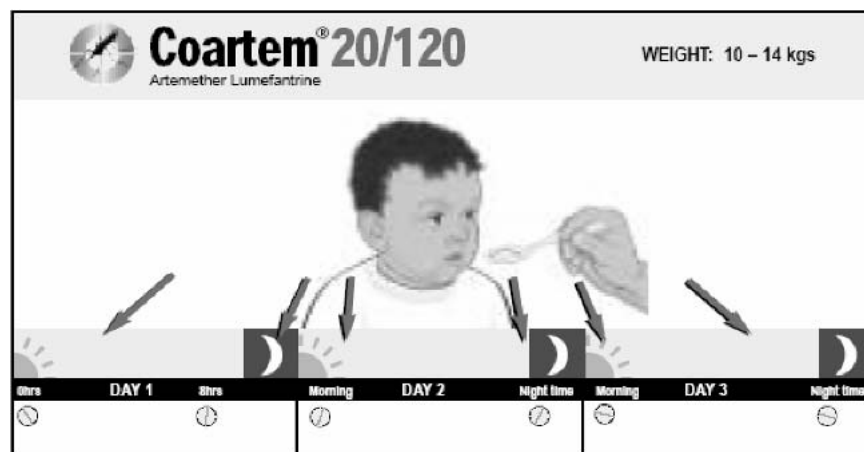
FIGURE 1. Pictorial instructions on the World Health Organization artemether-lumefantrine (Coartem®) blister pack (example for weight range = 10–14 kg).

Statistical analysis. Data were entered on Epi-Info version 6.04 (Centers for Disease Control and Prevention, Atlanta, GA) and analyzed using SPSS version 10.0.5 (SPSS, Inc., Chicago, IL) and Stata version 8.2 (Stata Corporation, College Station, TX) software. The three categories of adherence were presented as proportions and compared among age groups using a chi-square test. The association between adherence and several exposure variables (age, educational level of the respondent, number of children cared for by the respondent, history of antimalarial intake, presence/absence of fever on presentation) was first analyzed in a univariate model using a chi-square test. For this purpose, the two groups probably non-adherent and definitely non-adherent were combined into a non-adherent group so as to increase statistical power. Exposure variables were categorized as follows: axillary temperature as fever if \geq 37.5^\circ\text{C} ; parasitemia as low ( < 500 parasites/ \mu\text{L} ), medium (500–100,000 parasites/ \mu\text{L} ) or high ( > 100,000 parasites/ \mu\text{L} ); household size as < 5 persons and \geq 6 persons; and number of children cared for by the respondent as < 2 and \geq 3 . Explanatory variables associated