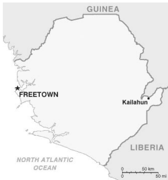
Figure 1 Location of study site.

kg/day (Camoquin®, Pfizer, Dakar, Senegal), and were followed-up for a period of 28 days.