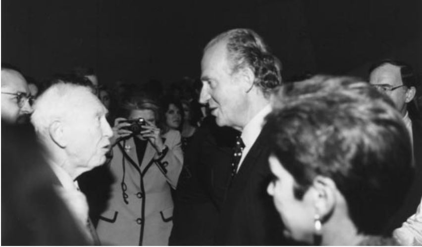
FIGURE 5. At the Kennedy Library in Boston in the spring of 1998 talking with the King of Spain.