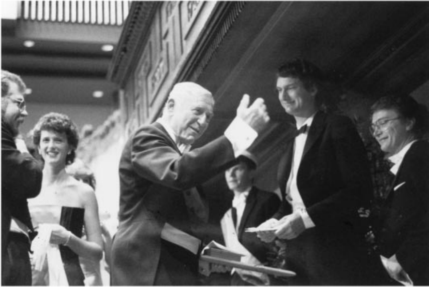
FIGURE 3. In Stockholm in 1985 after receiving the Nobel Prize.

Modigliani: I think it is true that if unemployment gets too low, then you will have accelerating inflation, not just higher inflation but higher rate of change of inflation. But I do not believe that if unemployment gets very high, you'll ever get to falling nominal wages. You may get very low acceleration of wages, or you may get to the point at which wages don't move. But I don't believe that high unemployment will give us negative wage changes.