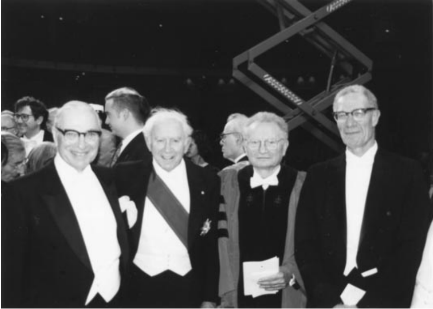
FIGURE 2. In Stockholm in December 1991 at reunion of the Nobel Prize winners. Left to right are Kenneth Arrow, Franco Modigliani, Paul Samuelson, and Robert Solow.