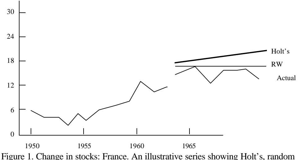
Figure 1. Change in stocks: France. An illustrative series showing Holt's, random walk, and actual hold-out data.

To illustrate the importance of causal forces, consider the series in Figure 1. (This is series 96 from the M-Competition, Makridakis et al. , 1982). As an inventory series, it is subject to opposing forces (inventories should not be allowed to get too high because of carrying costs, nor too low because service will suffer). Holt's exponential smoothing, which implicitly assumes supporting forces, extrapolates the recent trend upward. The random walk, an opposing forces model, does not extrapolate a trend. The assumption about causal forces was important in forecasting this series. Over the 6-year period shown, the ex ante forecast error from Holt's forecast was about 1.7 times greater