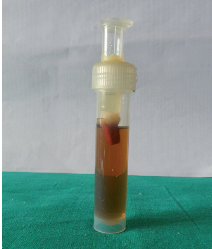
Fig. 1: Pipetter tips with inserted teeth snugly fitted into the holes of the lids and reattached to the vials; Broth placed in the lower chamber.