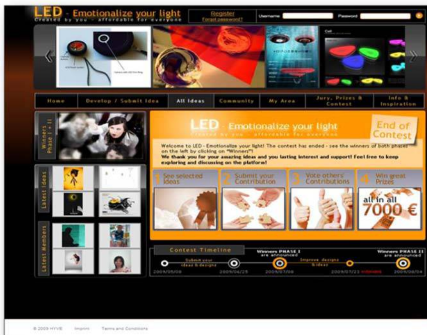
Figure 2. The LED emotionalize your light design contest

our online questionnaire was sent out to all 952 participants that had initially registered for the contest. For the main questionnaire, we received data from 132 participants. Cases with excessive missing (more than 10% according to literature) were removed. We also deleted cases with a completion time of less than 3 minutes. Once the data purification process was completed, 121 cases remained for further analysis, a (purified) response rate of 13 percent. The data for loyalty t_1 was then matched with the data from the main questionnaire based on the logfile user identifier. To test for a possible non-response bias, we compared the means of early responders and late responders (Armstrong and Overton, 1977), finding no significant differences. Thus, non-response bias did not seem to be a problem. We also compared the survey sample to the total contest population of 952 participants about whom we had received the personal demographic data supplied upon registration. As Table I shows, there is no significant difference between our sample and the total population in terms of gender, but survey participants were on average somewhat older than the average contest participant (mean age 29 years vs 27 in the basic population).