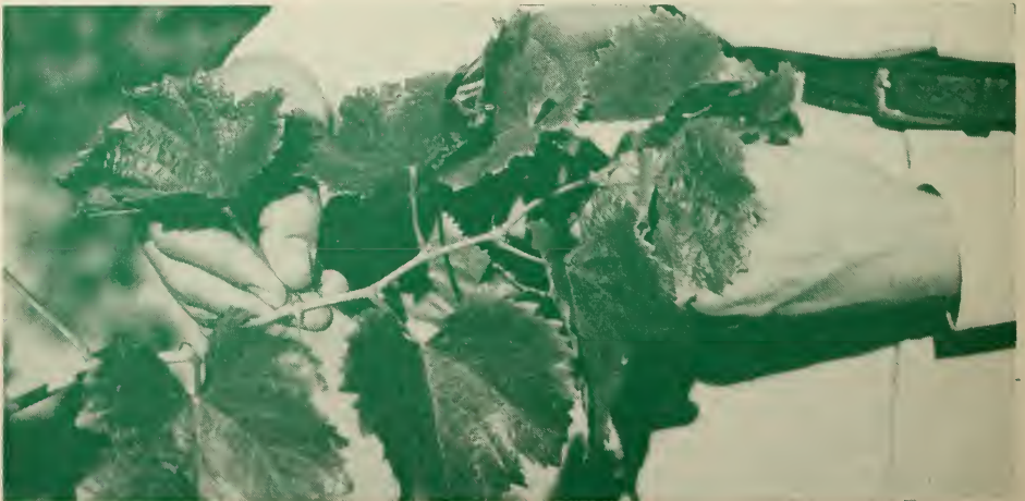
Fig. 4. Choosing a sample for plant analysis. The part of the plant chosen is important for good results with this method, and varies with the crop.

A careful survey of soils is being made to learn how to interpret and apply new chemical and biological tests. Special attention is being given to questions of potassium and phosphate availability in California soils. Eventually the results of field experiments should show whether these tests are useful.