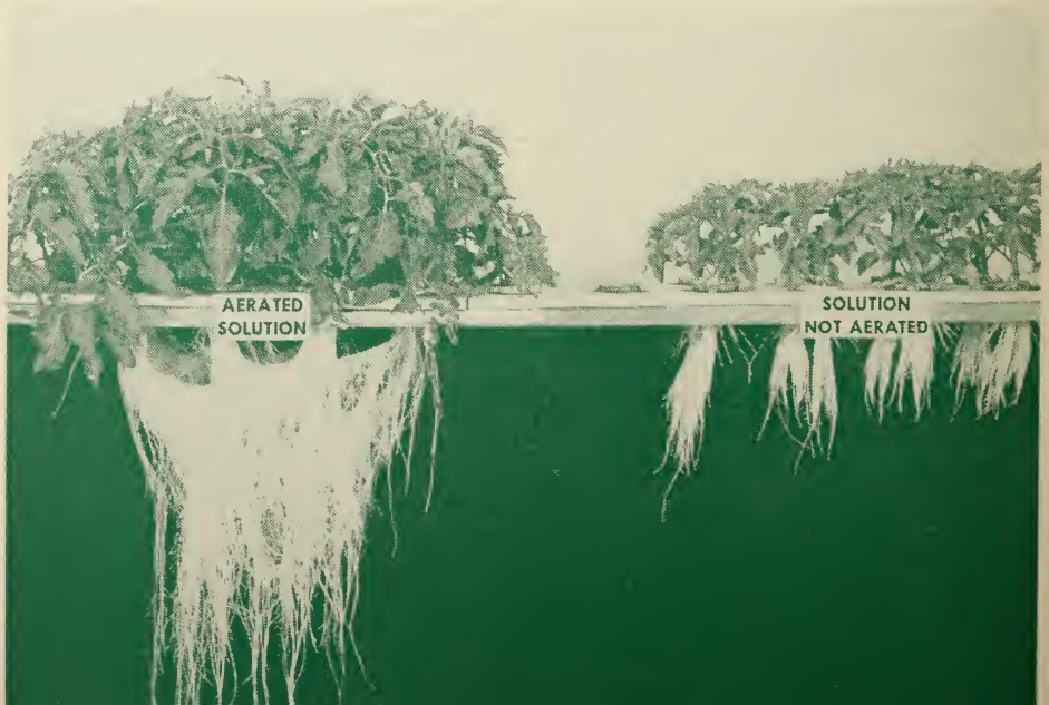
Fig. 2. The tomato plants on the left were grown in a complete nutrient solution with air bubbled through it; those on the right were grown in the same solution without aeration. Air in the soil is as necessary as in the nutrient solution.

Because the substances needed for root growth are made in the leaves, top growth also affects root growth. In this way, climatic conditions, diseases, injuries, even fruit production, may affect root growth and hence the mineral elements the plant can get from the soil.