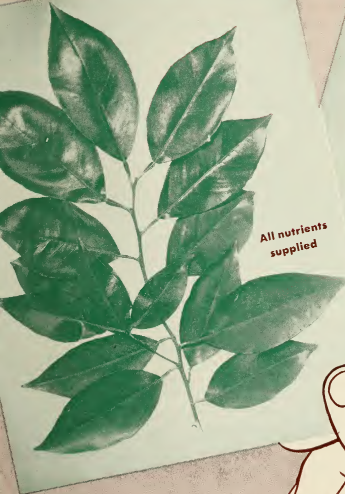
All nutrients supplied