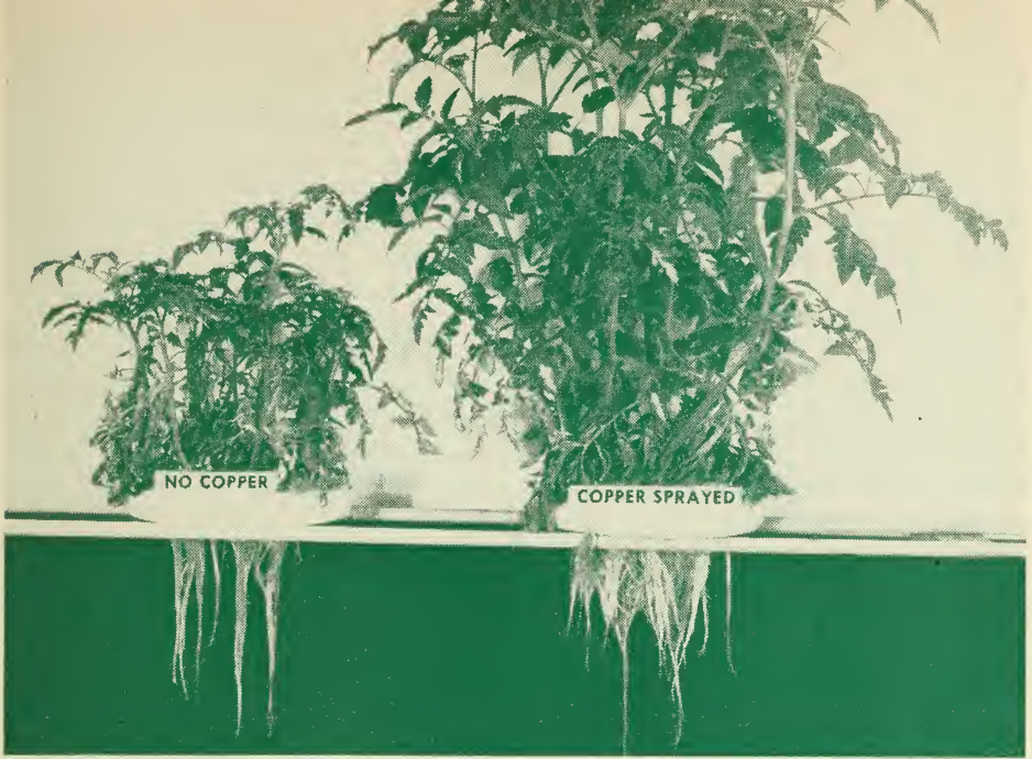
Fig. 1. Left, tomato plant grown in the laboratory with all needed plant foods except copper. The plant on the right was grown under the same conditions except that a solution of a copper salt was sprayed on the leaves. In California, there has been no report of copper deficiency in tomato plants grown in the field; but fruit trees on a few soils show the effects of lack of copper.

of certain plant diseases that could not be traced to any fungus or bacteria or virus. Recently they have found that some of these diseases could be prevented by supplying boron, or manganese, or zinc, or copper. Sometimes the missing element is put on the soil; sometimes it is sprayed on or injected into the plant. In Australia, the failure of some crops in certain soils has been traced to lack of molybdenum.