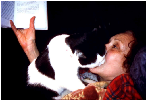
Fig.2 Carolee Schneemann, Infinity Kisses II, one from the series

Along with the disappearance of Derrida’s cat from “The Animal that Therefore I am” — a disappearance hovering between a failure of curiosity and an ethical refusal — Haraway also finds the repetition of a philosophical trope trapping Derrida in a scene dominated by its visuality, and punctuated by his naked body. He is naked before his cat. Naked and ashamed. Yet with Haraway’s acknowledged Catholicism and the emphasis on the sins of the flesh, following Derrida’s visual emphasis she loses track of its equivocality. On the one hand, she’s right — this is about Jacques and not his cat, about whom we learn very little — but the way it is about Jacques makes a difference. Derrida’s phrasing is odd. He writes: