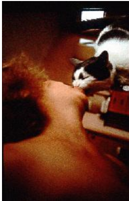
Fig. 1. Carolee Schneemann, Infinity Kisses I , one from the series, image courtesy of the artist.

—Cixous, 'Writing Blind' [1996] in Stigmata: Escaping Texts , 1998 (140)