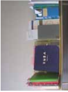
Elysa Lozano, Constructing frameworks , video, 2005. At http://eprints-gro.gold.ac.uk/150