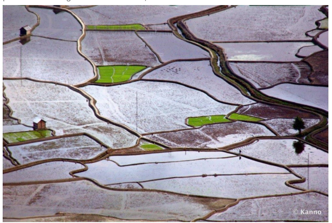
Figure 3. Paddy field during monsoon period in Ziro Valley

The areas of gentle or steep slopes that are not suitable for crops are used to develop the bamboo and pine groves, from which the valuable trees are then used as building material and fuel. Thus, there is no wasteland in the Apatani valley; every inch of land is used for some purpose. Individual families maintain this plantation. Once the grove has been cleared, it is the duty of the respective family to plant new bamboo and pine saplings so the next generation, their children, can use them in the future. This is a practice carried out by the forefathers of the Apatanis. With such efforts, the biodiversity of the landscape has continued to remain intact over the decades.