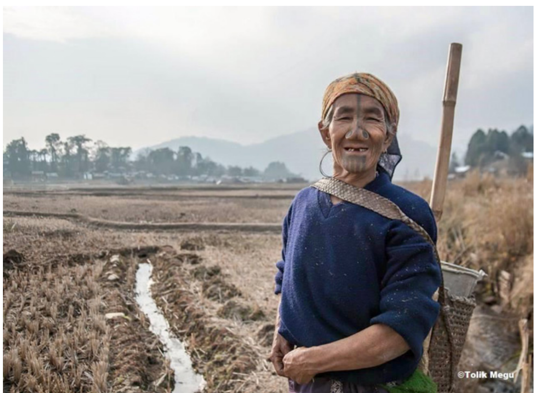
Figure 4. Apatani woman practicing agriculture in Ziro Valley

There is a fraction of villagers, belonging to a younger generation, that are moving out of this area, in search of better education or employment, but the dedication and importance of their agricultural practices remain close to their hearts. During the harvest season, all of the family members, from youth to elderly, whether residing in Ziro or outside, get together to work in their fields. It is also observed that locals are growing commercial crops instead of laboring in their agricultural field. Though this trend has not overridden