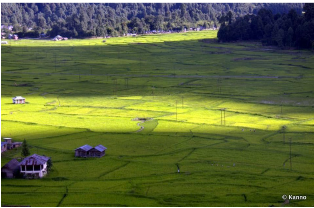
Figure 2. A view of Apatani Cultural Landscape

In the context of exploring the Apatani cultural landscape by the UNESCO Category 2 Centre-India, the author collected information from the Ziro Valley in July 2016, interviewed 40 local people, between the ages of 18 and 60 years old, and observed the practices of the Apatani people during monsoon season. There are seven main villages in the Ziro valley Bula (consisting of Kalung, Reru and Tajang villages), Hari, Hong, Michi-Bamin, Mudang Tage, Duta, and Hija. The total population of these villages