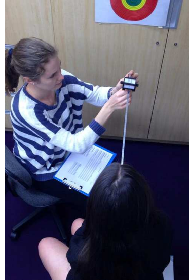
Fig. 2b. Near point convergence being measured by the Royal Airforce Rule with the subject in a torsion position to the left.

Only subjective values were documented as previous studies indicated that objective and subjective break produced the same results (Siderov et al., 2001; Adler et al., 2007). This procedure was performed with participants sitting with their head and trunk in a neutral position as well as in a neck torsion position to the left and right (Figure 2b). Torsion NPC measures were obtained directly following those in neutral. Placing the subject's neck in torsion involved the examiner gently holding the head still whilst the patient turned their trunk 45 degrees to the left or right. A laser situated on the patient's head pointing directly towards a target located 1.05m above the ground, provided a visual cue for each participant and the examiner to maintain a static central head position whilst the trunk was turned.