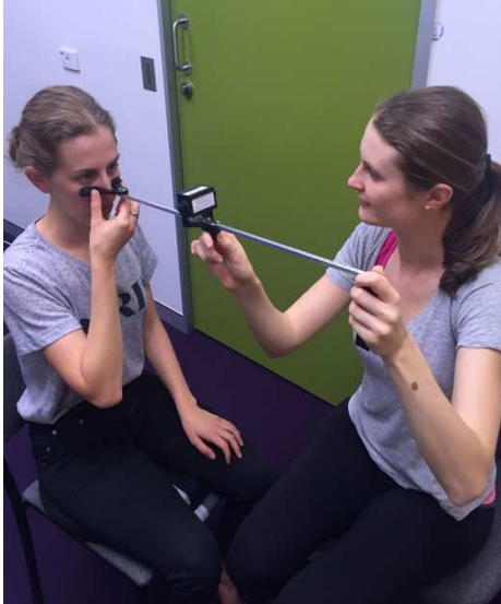
Fig. 2a. Near point convergence being measured by the Royal Airforce Rule with the subject in a neutral position.

moved towards them at approximately 2cm per second from a starting position of 50cm. The subject was instructed to notify the clinician when diplopia (the single line became 2 distinct lines) occurred (subjective NPC break point) (Figure 2a). (Adler et al., 2007).