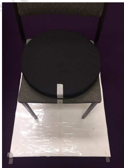
Fig. 1. Experimental set-up with rotating cushion seat and markers on a plastic mat indicating 45 degrees to the left and right. The line on the centre of the rotating cushion was matched to the 45 degree line on the mat to allow consistency with the rotated position.

Subjects wore their usual corrective vision devices to see an object clearly at 50 centimetres (cm) and held the black cheek rest of the RAF Rule underneath their eyes whilst the clinician stabilised the other end. Participants were instructed to focus with both eyes on an image, (vertical line with a small dot in the middle), tilted down at 15 degrees.. The target was then