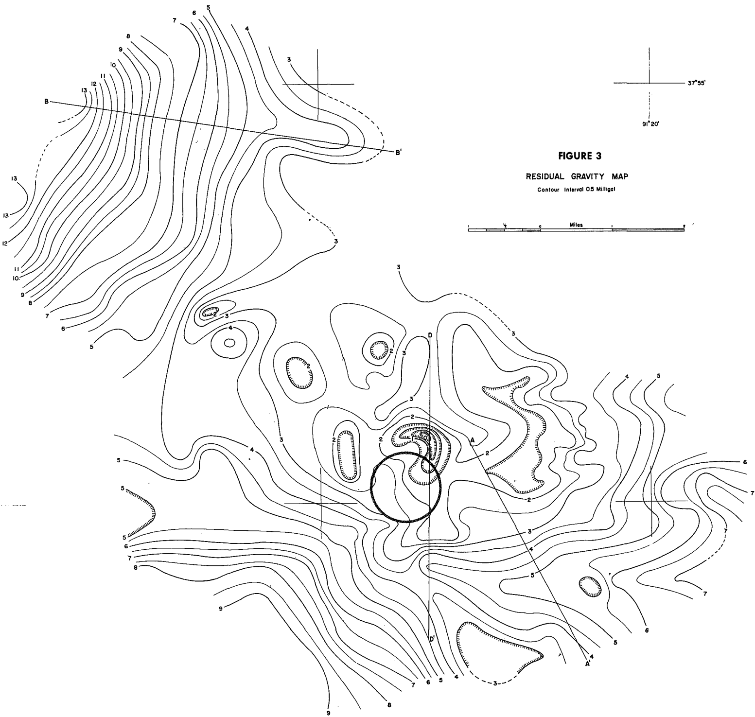
FIGURE 3 RESIDUAL GRAVITY MAP Contour Interval 0.5 Milligal