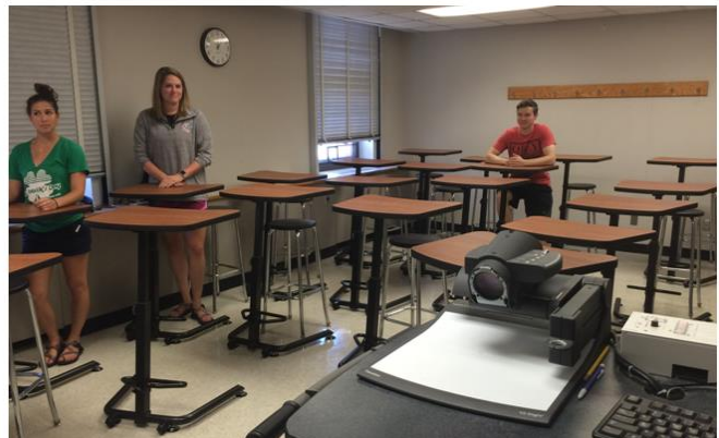
Figure 3. Sit-stand desks

In the Fall of 2016, our team introduced 25 sit-stand desks into Field House room 332 (see Figure 2). The desks are easily height adjustable for people of different heights and are paired with a bar height stool to allow for sitting during class. Students had the option to sit or stand at their leisure while having access to these desks.