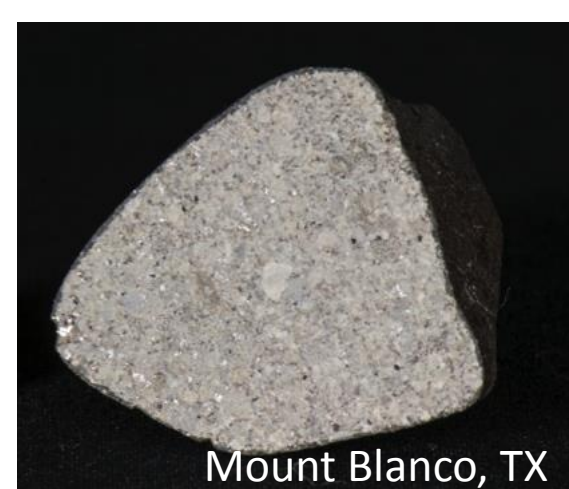
Mount Blanco, TX

Refinement of software tools to streamline data processing, and development of methods to directly measure total fall mass from RADAR reflectivity.