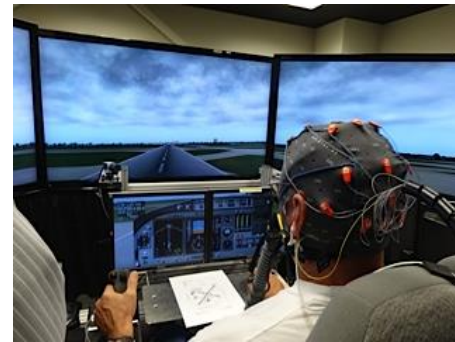
Figure 1. Schematic depiction of ROBD-2 configuration Figure 2. Test subject in flight sim