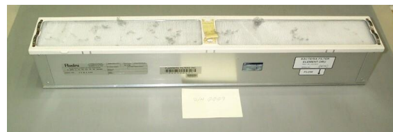
Figure 1. An ISS Bacteria Filter Element. Each filter element weighs 2.6 kg and occupies 7.3 liters.

A model of filters in a series arrangement is used to determine the overall capturing efficiency of a multi-stage filtration system. Figure 2 shows how the first filter component captures some of the incoming particle load and allows the remaining load fraction to pass to the next stage. Successive stages capture different particle size fractions to yield the overall filtration performance.