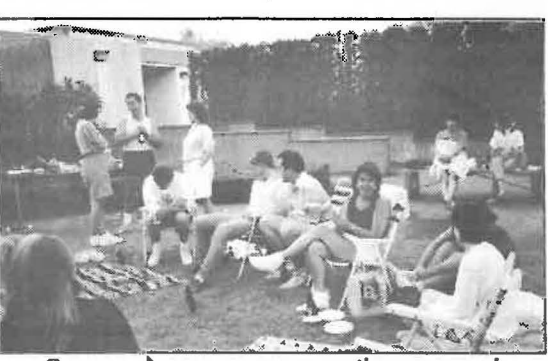
Some ... ) sum sum summertime appeared in time for the JI Barbeque on June 15.

ever - June 12 - it's well ... you remember, I don't have to remind vou. In Vancouver. where during the winter we have to squeegee our car windows rather