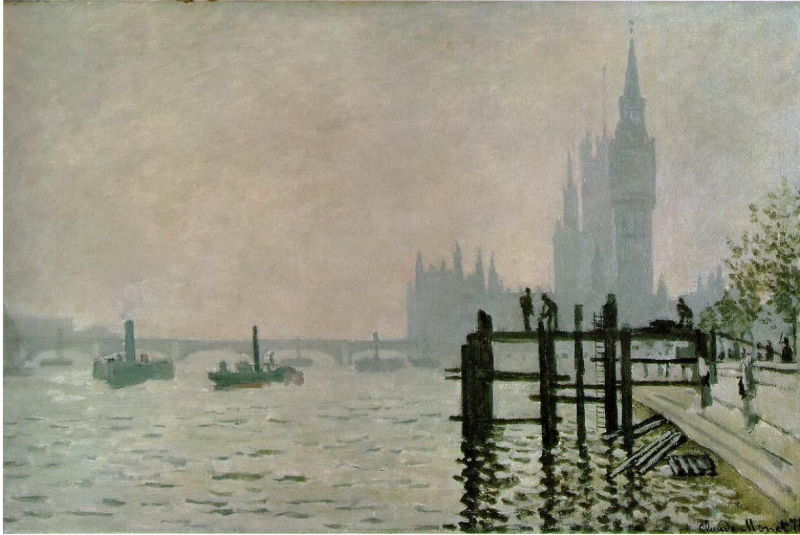
The Thames at Westminster (Westminster Bridge) , Claude Monet, 1871 (130 Kb); Oil on canvas, 47 x 72.5 cm (18 1/2 x 28 1/2"); Collection Lord Astor of Hever; National Gallery, London.

A paper presented at York St. John University November 2010