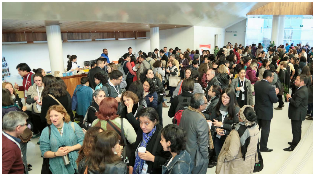
CILELIJ provided educators, authors, scholars, and librarians the opportunity to connect with each other to learn from each others' efforts to promote literature for children and young adults.

Staff working in Mexico's National Institute of Indigenous Languages, Dirección General de Lenguas Indígenas , shared information about their latest publications, including materials for all ages in all of the indigenous languages that are documented in Mexico. Also in attendance were librarians and promotores de lectura who have worked in their communities for many years coordinating activities to promote literacy in popular non-traditional reading spaces. For example, Amoxpoani Promotores de Lectura leads story and craft hours at local markets every Sunday. They continuously explore using new materials and methods for storytelling, including performance, puppets and kamishibai theater. Those conversations inspired great ideas for culturally rich and entertaining literary activities that I would like to try in my work as a bilingual youth librarian.