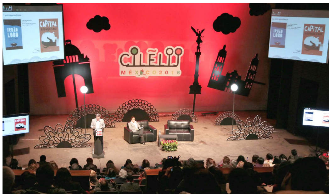
The third edition of Congreso Iberoamericano de Lengua y Literatura Infantil y Juvenil (CILELIJ), held in Mexico City in November 2016, brought together over 70 speakers from 16 countries to talk about literature for children and young adults.