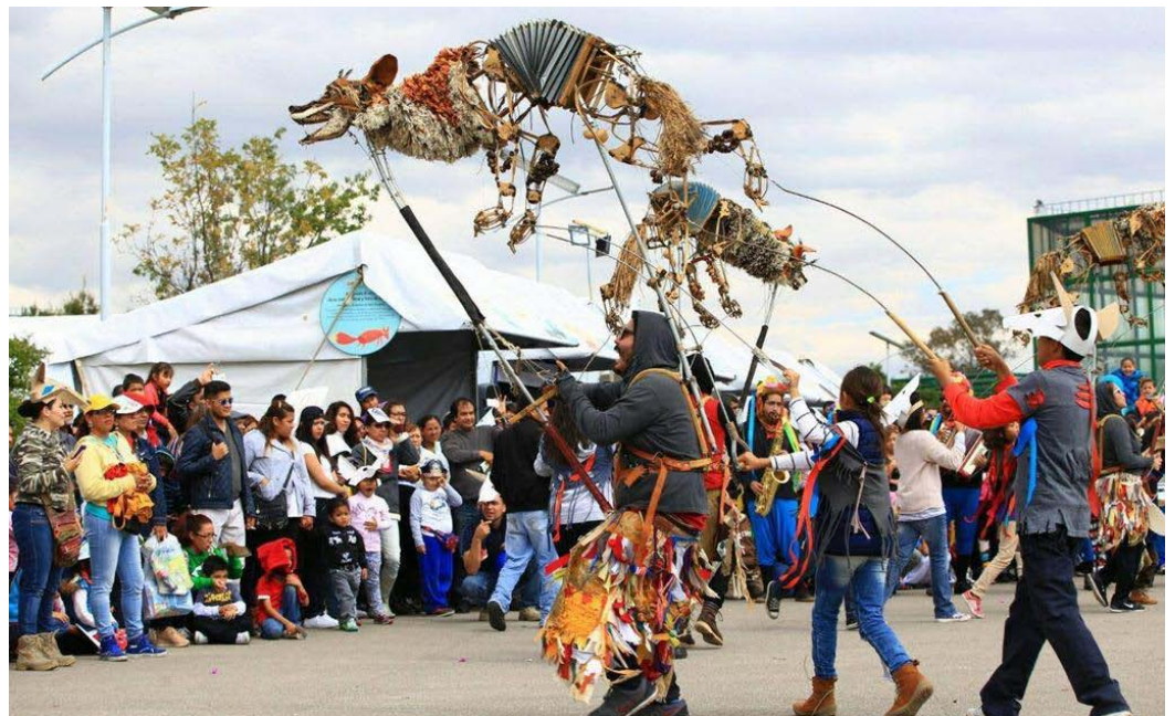
Las bestias danzan (The beasts dance) performed by a local theater group, La Liga — Teatro Elástico, during FILIJ 2016.

As the Spanish-language publishing market expands, FIL attendance continues to grow, and so do its program offerings. Leyhla Ahuile of Publisher Weekly reported that FIL 2016 hosted 2,000 publishers with books in 23 different languages, including indigenous languages such as Tzotzil, Zapoteco, Nahuatl and Maya. During FIL 2015 I had the opportunity to attend a book launch of Sendak's Where the Wild Things Are translated into Maya. Due to the increasing geographic diversity of authors and publishers that participate in FIL, the fair has been called the "New Frankfurt" by Tomás Granados Salinas, The Bookseller , and others. Frankfurt is the largest and most important book fair in the world.