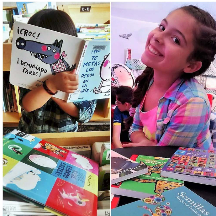
Treasures found at the Feria Internacional del Libro (FIL) that will surely be popular among library readers.