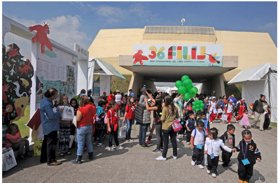
A view of the entrance to the Feria Internacional del Libro Infantil y Juvenil (FILIJ) as school groups arrive at the fair. FILIJ outgrew its location and was relocated in 2016 to the Parque Bicentenario, receiving visits from over 42,000 students from 450 schools.

In 2015, U.S. librarians attending FIL increased by 45 percent from 2014. In preparing for attending the FIL a second time, I reviewed circulation statistics for MCL's Spanish language collection and received feedback from colleagues about the needs at each location. Based on this information, and from learning the previous year how crucial it is to be strategic and stay focused during the limited time at FIL, our selection focused on juvenile materials and