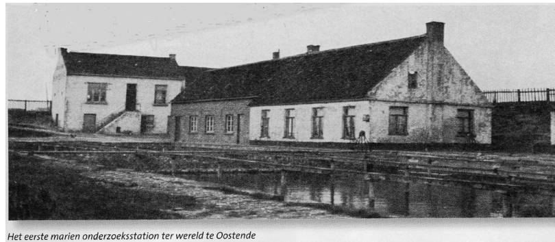
Figure 3. The world's first marine biology research station, erected in 1843 in Ostend [Oostende, Ostende] Belgium. Though fish and oysters study were the principal concern of this institute, founded by professor P.-J. Van Beneden, shrimps were not ignored. This is an archive photo as the station was completely wiped out to widen Ostend's port access.