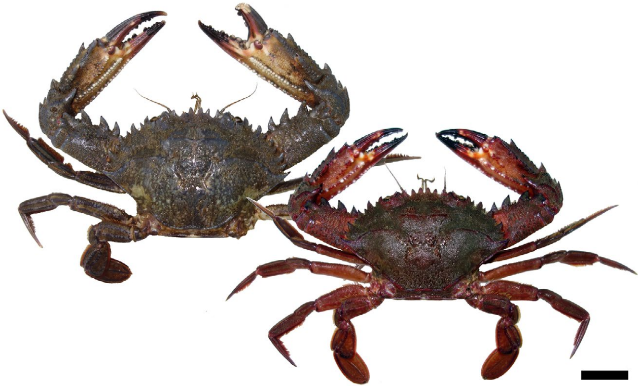
Fig. 3. – Cronius ruber (Lamarck, 1818) from the Canary Islands. Males, dorsal view, greenish (ICCM422, 81.20×54.70 mm) and reddish (ICCM423, 68.53×43.86 mm) colour patterns.

is only known from the Gulf of Mexico (Mantelatto et al. 2009, Davie 2015).