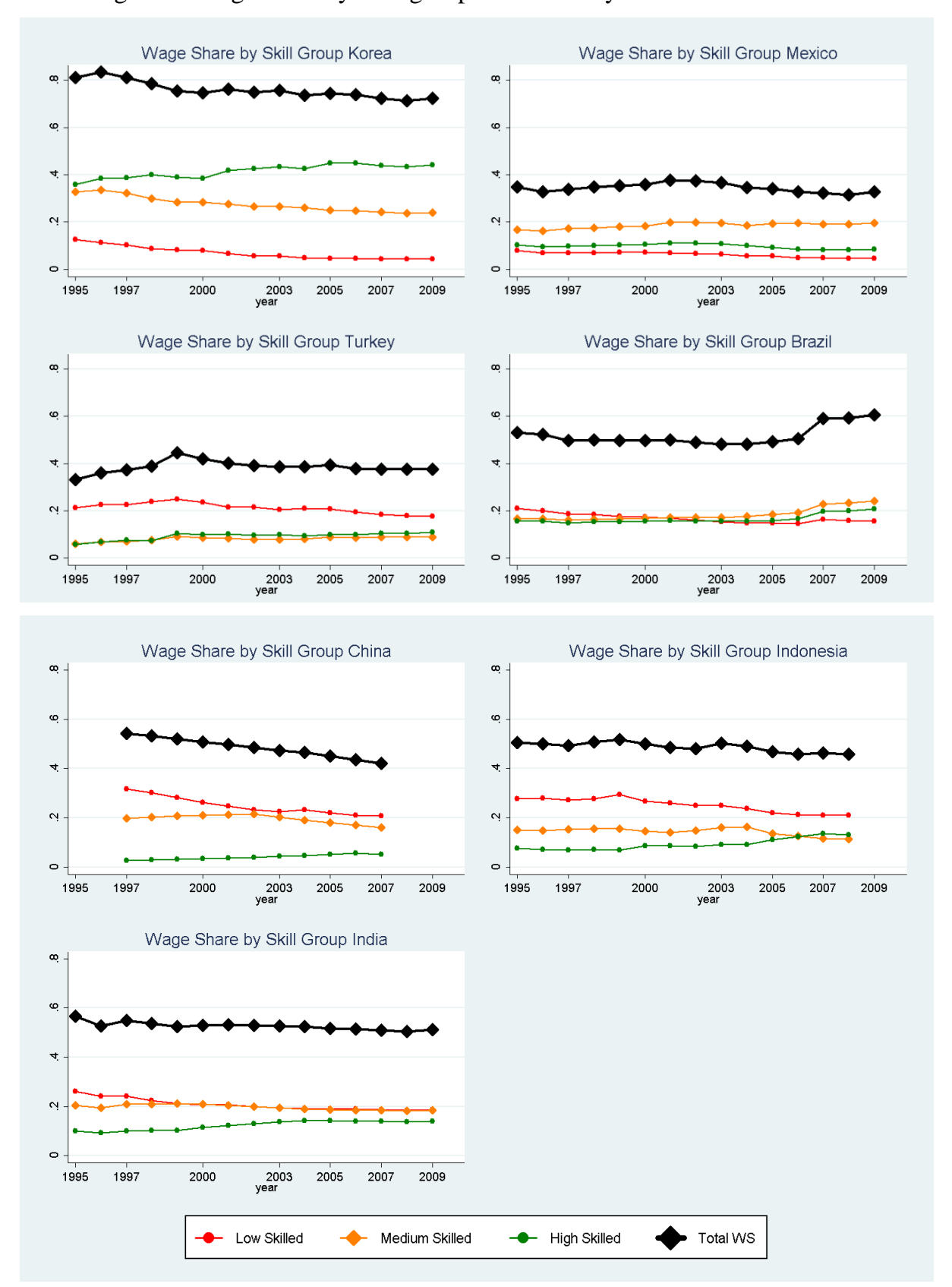
Figure 2: Wage share by skill group as defined by workers' education