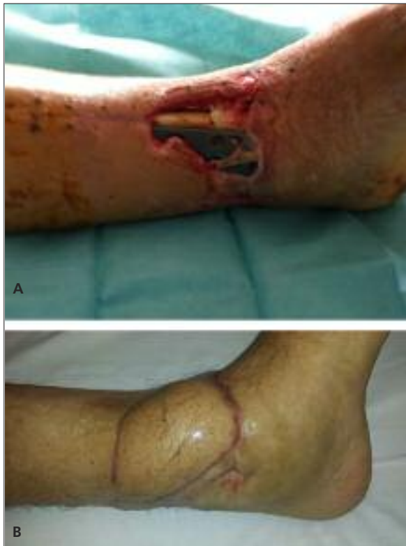
Figure 2. A , Trauma to the lower leg with hardware exposure. B , Reconstruction with a sural flap.

The most important data emerging from our review are two: the higher implant preservation rate in the pedicled flap group compared to the free flap group (78.12% vs. 53.33%) and the higher prevalence of postoperative complications in the pedicled flap group (46.87% vs. 10.20%). In particular, the first observation appears to be in contrast with the current trend of considering the free flaps the first choice procedure for soft tissue coverage of the wounds with internal hardware exposure. This is probably due to the fact that the choice of a pedicled flap is reserved for less complicated cases with limited tissue loss. Nevertheless, the choice of the more appropriate surgical procedure should be evaluated singularly according to the general and local conditions of the patient, keeping in mind that the two are both valid options for soft tissue coverage in case of hardware exposure.