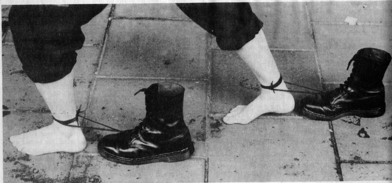
Mona Hatoum dragging Doc Martin boots in the May 1985 street action Roadworks , Brixton.