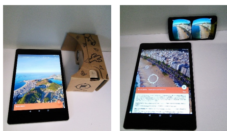
Figure 1: (a) Tablet and a cardboard viewer with the phone slotted in; (b) The tablet is in 'guide (educator) mode and the phone is in 'follower' (or student) mode.

Using a tablet and via the GEs app, the educator guides the students to look at the scenes of an expedition. The students use the app in the 'follower' mode and experience the GE/VR through the smartphone embedded within a VR viewer. Figure 1 (a) shows a tablet and a cardboard viewer with the phone slotted in; in (b) the tablet is in 'guide' (or educator) mode and the phone is in 'follower' (or student) mode. On the tablet, the educator selects a point of interest (the circle). A smiley face on the tablet shows where the student is currently looking.