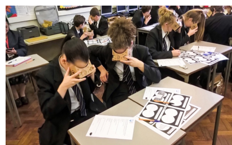
Figure 6: Students of Year 10 conducting an inquiry activity in pairs with GE as an ISM (GE: Borneo Tropical Rain Forests: Plant Adaptations).

In a Geography lesson (Figure 6) that used the GE of 'Borneo Tropical Rain Forests: Plant Adaptations' as ISM, a student enquired: 'how did the mangrove leaves adapt to take in the salt?' The educator later observed in the post-lesson reflection session with us that it was a higher-order question: 'That's really interesting because they are now asking why? They know they do, now they want to know how.'