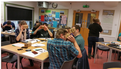
Figure 2: Workshop with fieldworkers at UK's Field Studies Council centre at Preston Montford, Shrewsbury.

For students, we developed written activity-sheets specifically addressing the third research question on inquiry-based learning. Following the interaction with GEs during a lesson, the educator asked students to carry out two activities: