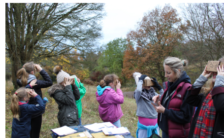
Figure 5: An educator using GEs during a field trip to a local reserve (GE: Environmental Change in Borneo).

In our project, a Geography educator used the GE of Environmental Change in Borneo during a physical field trip to a nature reserve to sensitise her students about the impact of change (e.g. construction, tourism) to natural environments like in Borneo (Figure 5). She then asked her students to reflect on how their local nature reserve will change because of the proposed development related to a High-Speed train route that will run close to the reserve.