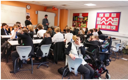
Figure 4: An educator showing the simulation in a biology lesson to Year 11 (GE: Human Anatomy - Respiratory System).

pedagogically effective when the students already have some basic understanding of the concept or the process in the simulation.