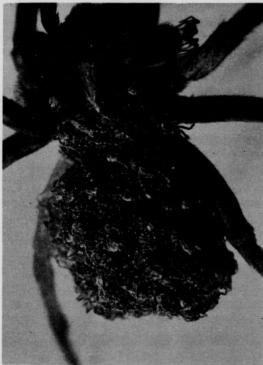
Fig. 2 Female lycosid with young on her back.

Maternal care ends when the spiderlings leave their "mother's" back and disperse by ballooning.