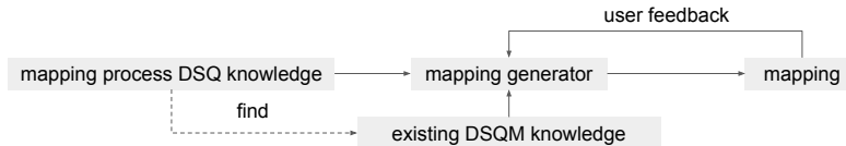
Fig. 1: Overview of the Approach

improves, by using DSQMs, because the DSQMs might contain knowledge that already tackles these challenges and DSQMs have proven benefits [8, 9]. However, we aim to use an extended set of knowledge compared to previous efforts to improve the mappings to tackle these complex challenges. Therefore, we need to discover existing DSQM knowledge, i.e., find the relevant DSQM knowledge that is already available before the mapping process. This leads to the following main research question: can we improve the (semi-)automatic generation of new single-scenario mappings using existing DSQM knowledge? To answer this question, we need to answer these subquestions: