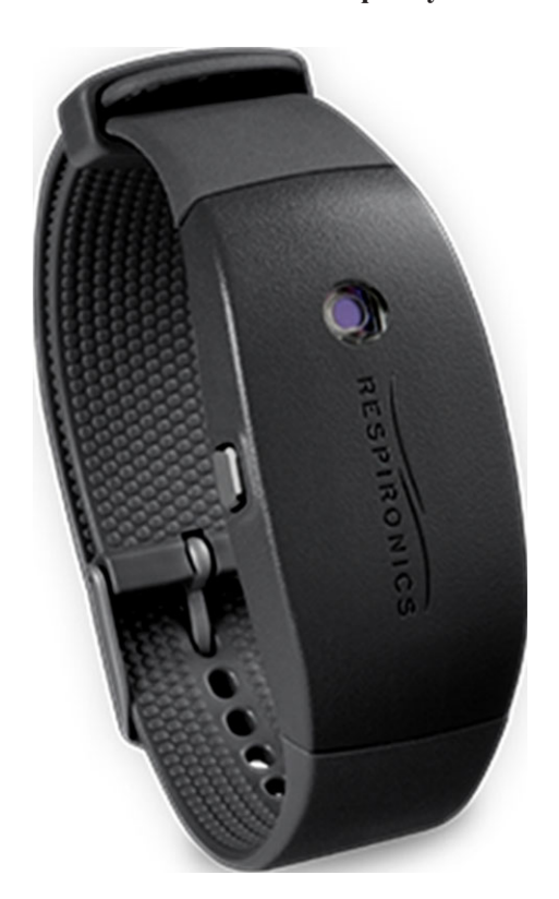
Fig. 1 Philips Actiwatch 2

Two measuring stations were used, one in the center of each side wall, to record the air temperature, relative humidity, and CO<sub>2</sub> concentration at 5-min intervals. No noise measurements were made inside or outside the room. A miniature data logger (HOBO U12-012) recorded the air temperature and relative humidity with an accuracy of \pm 0.35 K and \pm 2.5\% , respectively, and the signal from a CO<sub>2</sub> sensor (Vaisala GM20), calibrated for the range 0-5000 ppm, with an accuracy of \pm (2\% \text{ of range} + 2\% \text{ of reading}) . The ventilation rates were calculated from the CO<sub>2</sub> concentration at steadystate and the CO<sub>2</sub> generation from each person, the latter based on an activity level of 0.7 MET (sleeping), a standard respiratory quotient of 0.83, and the DuBois body surface area of the subjects. The maximum CO<sub>2</sub> concentration during the night was used if no steadystate concentration was reached. Steady state was