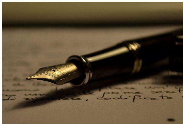
Figure 4. Fountain pen.