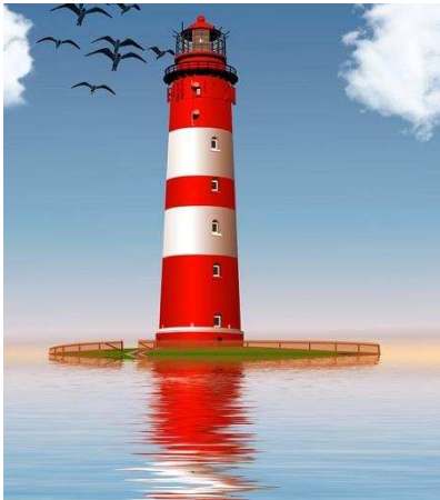
Figure 6. Lighthouse.

As a student, I see power to have both negative and positive connotations, for it can be used to suppress and to intimidate, yet it can also be used to enlighten others and improve the world around us. The picture of the lighthouse displays my metaphorical concept of power.