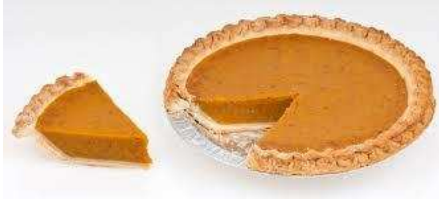
Figure 1. Pie.