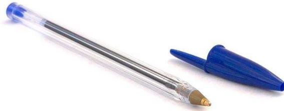
Figure 5. Biro pen.

I see power in education as different pens. The teachers would represent a fountain pen, which produces stronger, more prominent ink, and the students would be a common biro.