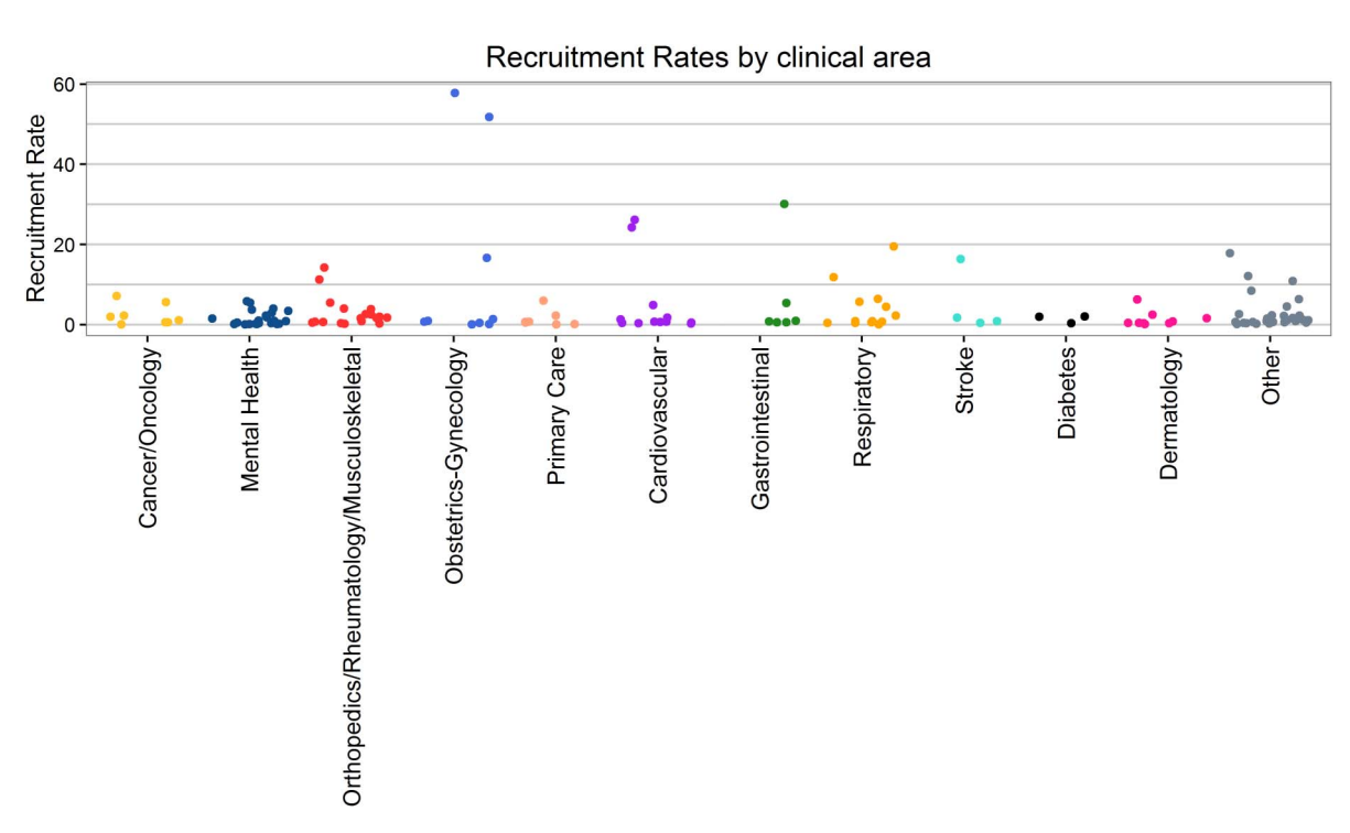
Figure 2 Recruitment Rates by clinical area for the 151 Health Technology Assessment trials considered.

From the 142/151 (94%) trials with sufficient information the median recruitment rate was found to